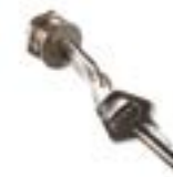
CM-B PAWL WITH TWO METAL RELEASE KEYS.