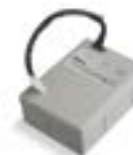
PS124 24 V BATTERY WITH INTEGRATED BATTERY CHARGER. PC/PACK 1