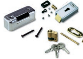
PLA11 horizontal 12 V electric lock (required for gates longer than 3 m) Pc/Pack. 1