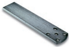
PLA6 rear bracket 250 mm long Pc/Pack. 1