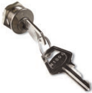
CM-B lock with two metal keys compatible with SELE