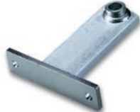
PLA8 screw-adjustable front bracket Pc/Pack. 1