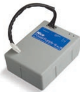
PS124 24V battery with built-in battery charger Pc/Pack. 1