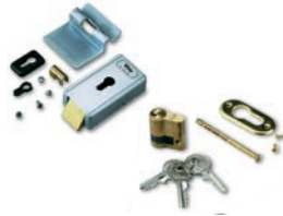
PLA10 vertical 12 V electric lock (required for gates longer than 3 m) Pc/Pack. 1